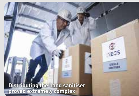
Distributing the hand sanitiser proved extremely complex

"The Grenadiers were really pleased to be able to help. We all found it extremely rewarding and felt we were making an important contribution."