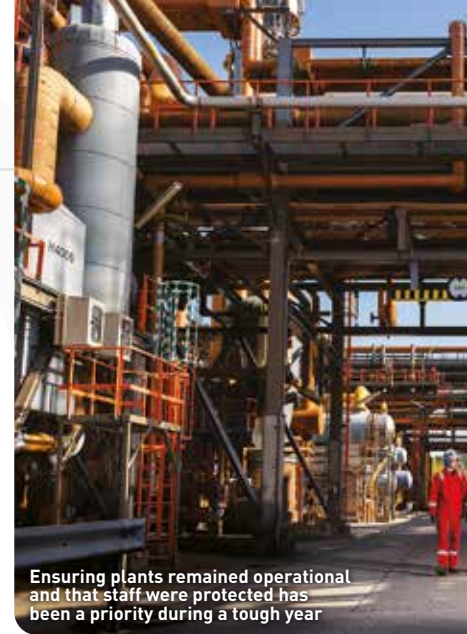
Ensuring plants remained operational and that staff were protected has been a priority during a tough year