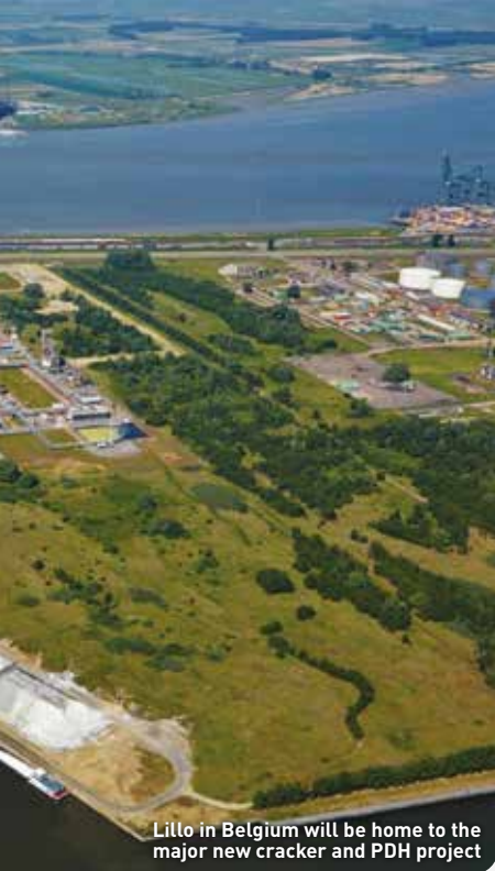
Lillo in Belgium will be home to the major new cracker and PDH project

The size and scale of the project is a first for INEOS. The environmental footprint of the project is also looking increasingly attractive, at less than half of CO2 emissions per tonne of product compared with the most efficient crackers in Europe.