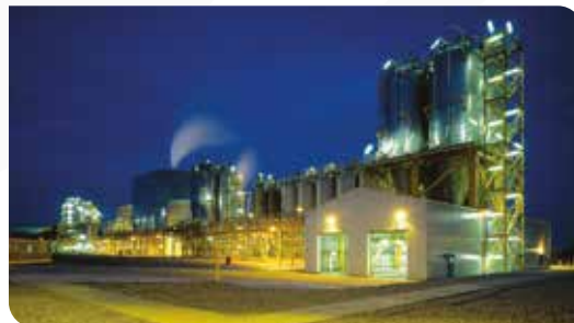
Newton Aycliffe in the UK was the first bottling site

“It was a real team effort; a united front that brought together all of