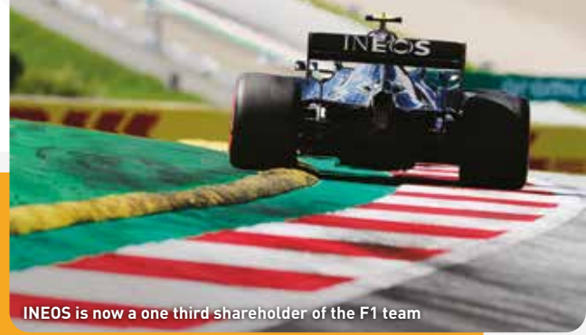
INEOS is now a one third shareholder of the F1 team

This past year, Mercedes-Benz Applied Science has also assisted INEOS TEAM UK in its preparations