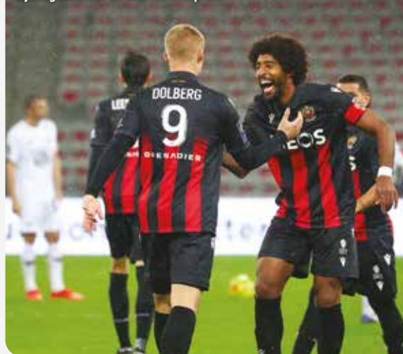
Eyeing success on and off the pitch

teams is building them from the bottom up. This is a project and it's going to take time to get all the building blocks in place. We're not yet the finished article but we're at the start of the journey," he says. "There's still a lot of work to do to fulfil our ambitions but we're making good progress, even if it may not always appear that way – but that's football."