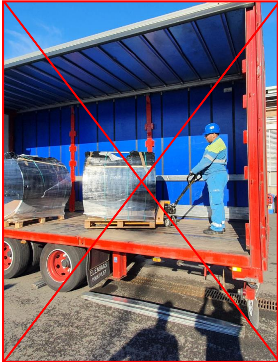
Open side: use pallet truck not allowed

⊘ Working at height without suitable fall protection.