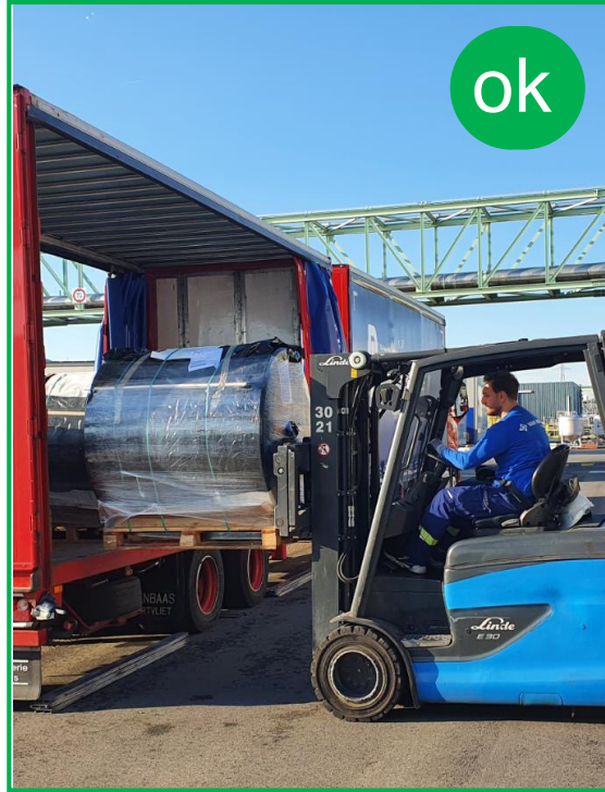
Open side: use forklift