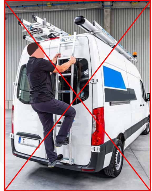
Climbing to the top is not allowed