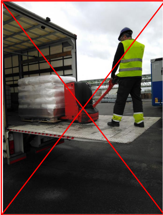
Tail lift: wrong use of pallet truck

⊘ Working at height without suitable fall protection.