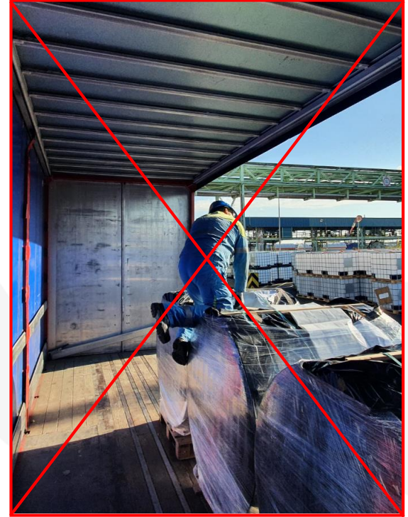
Climbing on cargo is not allowed