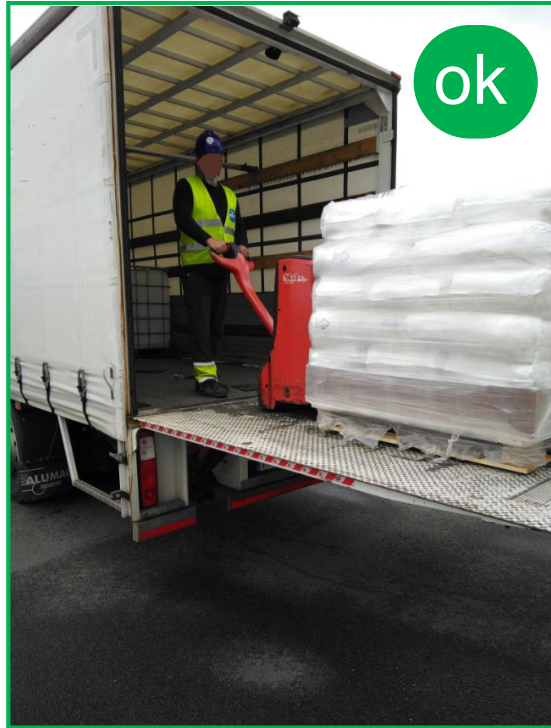
Tail lift: correct use of pallet truck