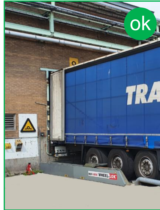
Loading dock with wheel chock or wheel lock