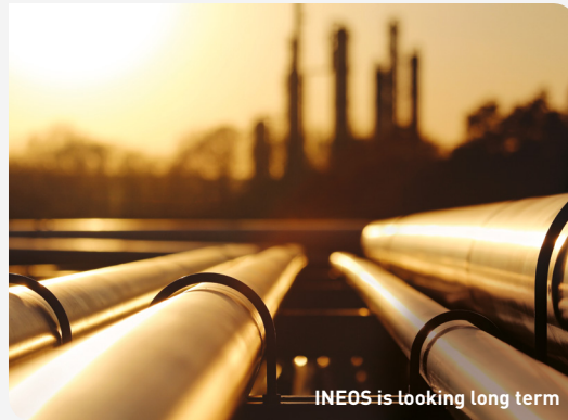
INEOS is looking long term

A few years after strategic acquisitions established INEOS as one of the leading oil and gas companies in the North Sea, it is starting on yet more ambitious investment plans