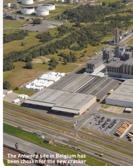
The Antwerp site in Belgium has been chosen for the new cracker

INEOS is undertaking a massive expansion programme in Europe, driven primarily by the need for a dependable and sustainable supply of feedstock