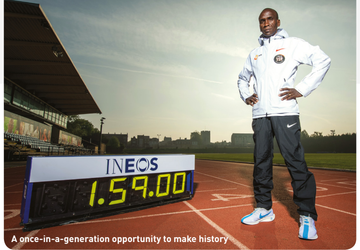
A once-in-a-generation opportunity to make history

"We want to see what can we do to at grassroots level to improve skills and leave an imprint with community football," he says.