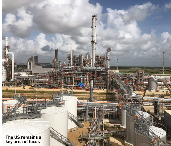
The US remains a key area of focus

Late last year, INEOS Enterprises added the chemical intermediates business of Flint Hills Resources and also agreed to buy the entire composites business from Ashland Global Holdings for $1.1bn. The former Flint Hills Business, which manufactures isophthalic acid, trimellitic anhydride and maleic anhydride at a plant near Chicago, Illinois, is now trading as INEOS Joliet.