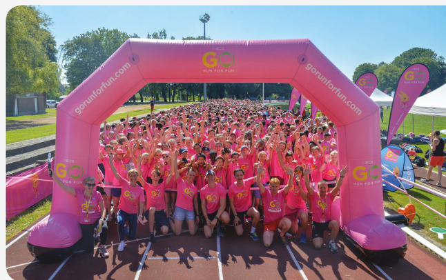
The initiatives encourage children to stay fit and healthy

INEOS Chairman Sir Jim Ratcliffe himself is also involved in some film making, namely the