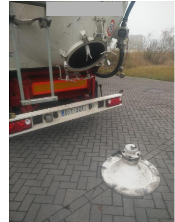
Manlid broken off